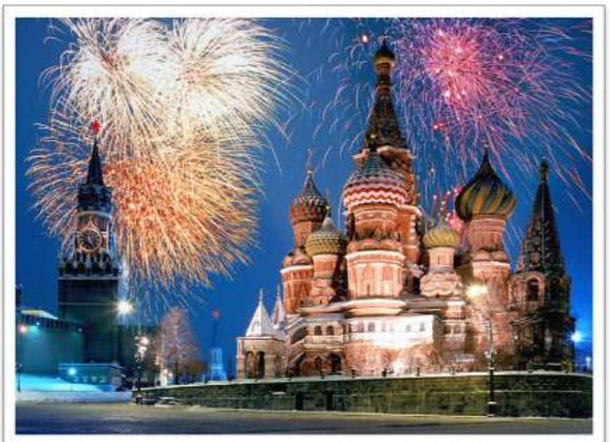
Fireworks at Moscow, Kremlin and Red Square