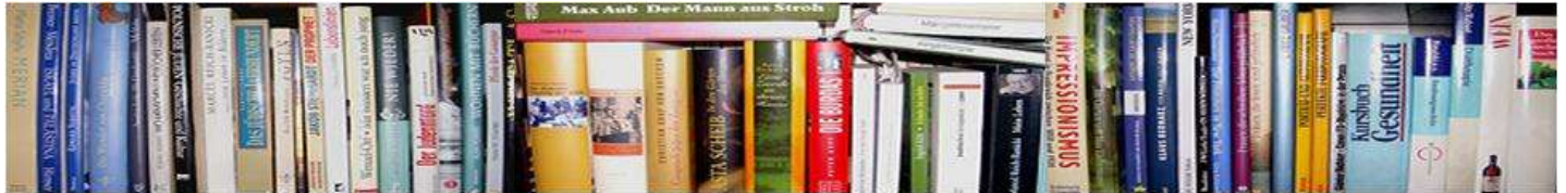
Free Texas