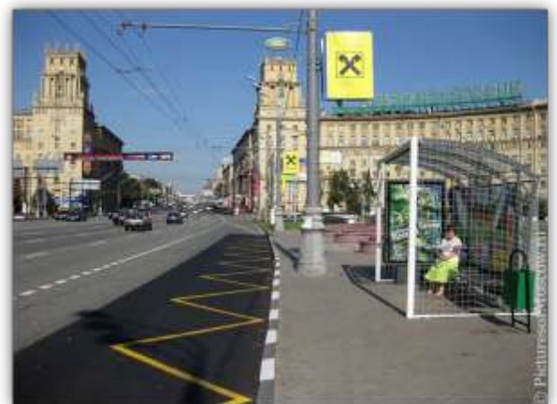
Streets of Moscow, Gagarin Square