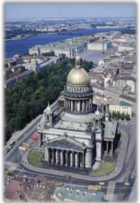
Famous Issacs Cathedral in St Petersburg

Although there are challenges, overall the expat environment is very developed and it is quite easy to hide in one of the expat communities. Many people, however, take a more adventurous route and live in the city centre, which allows for easy access to the cultural and entertainment offerings of the city. As traffic can be gridlocked all night long, the city vs suburb decision becomes quite important in determining your lifestyle. To make the most of your experience, learning (basic) Russian is critical, as this will allow you a much greater measure of independence and will open the door to potential friendships. Either way, you can get help from Outpost to get settled in, and there are many other organizations where you can meet helpful and interesting individuals who share common interests. Last, be aware that Russia is very different from anything you may have experienced before, so be open to different ways of doing things, different attitudes and cultural values, and eventually you will find your place, your friends and your Russia.