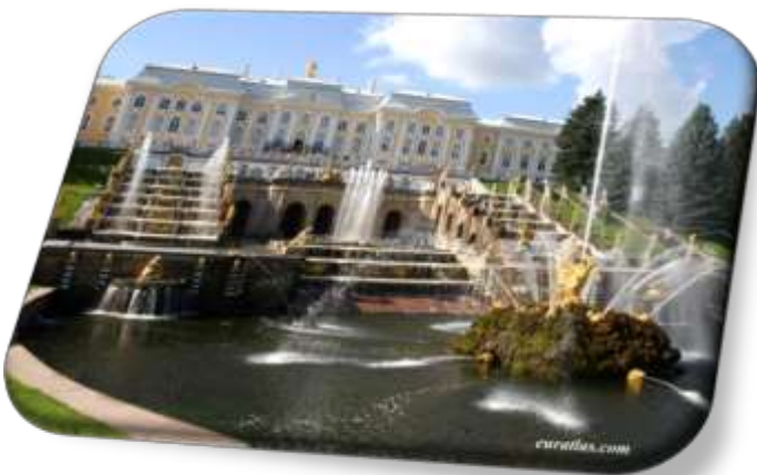
Famous Palace Peterhof in St Petersburg